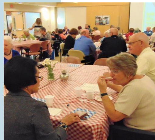
Volunteers enjoyed Kentucky fried chicken and a western motif at June Appreciation lunch.